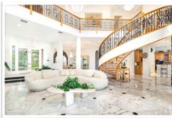
Elegance with a Twist Stairway, an Alluring Two-Story Estate