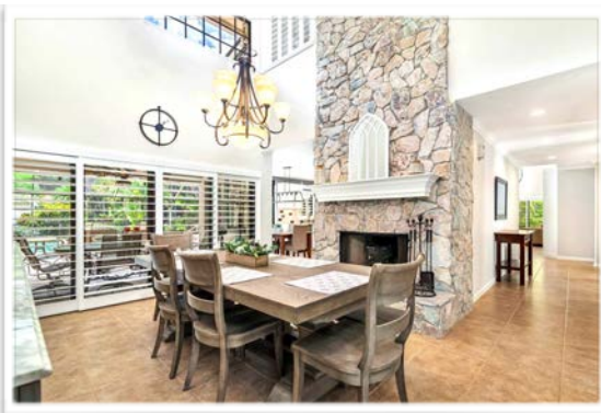
Modern Dining & Custom Stonework Fireplace Overlooking the Pool