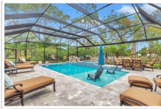
Spacious Fully Screened In Pool Paradise for Family & Guests